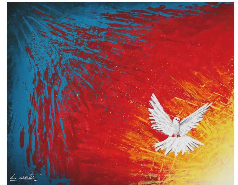
Divided tongues, as of fire, appeared among them, and a tongue rested on each of them. —Acts 2:3